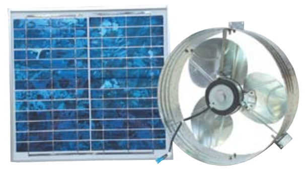
Model: VX2515SOLARGABL Includes Solar Panel and Gable Mount Attic Ventilator